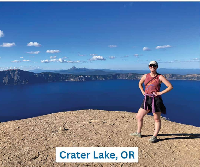
Crater Lake, OR