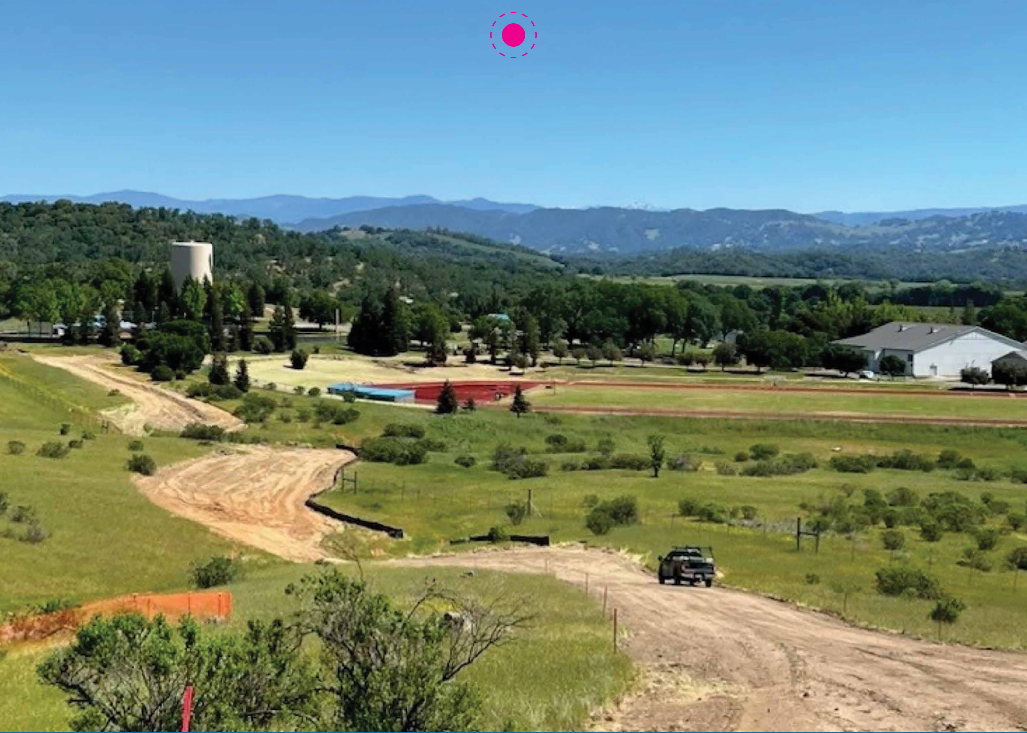
Mendocino College Project Location for Secondary Access Road