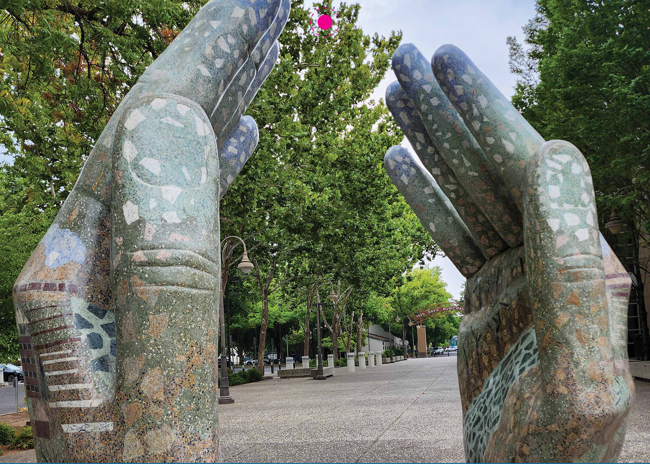
Our Hands, Chico, CA