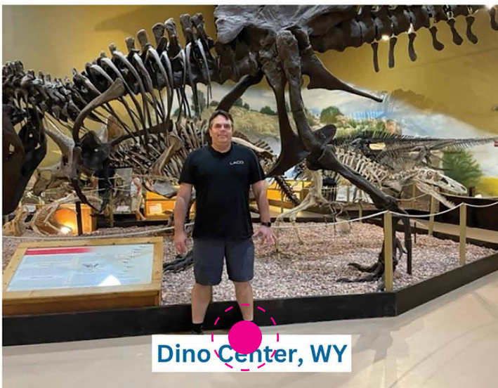
Dino Center, WY