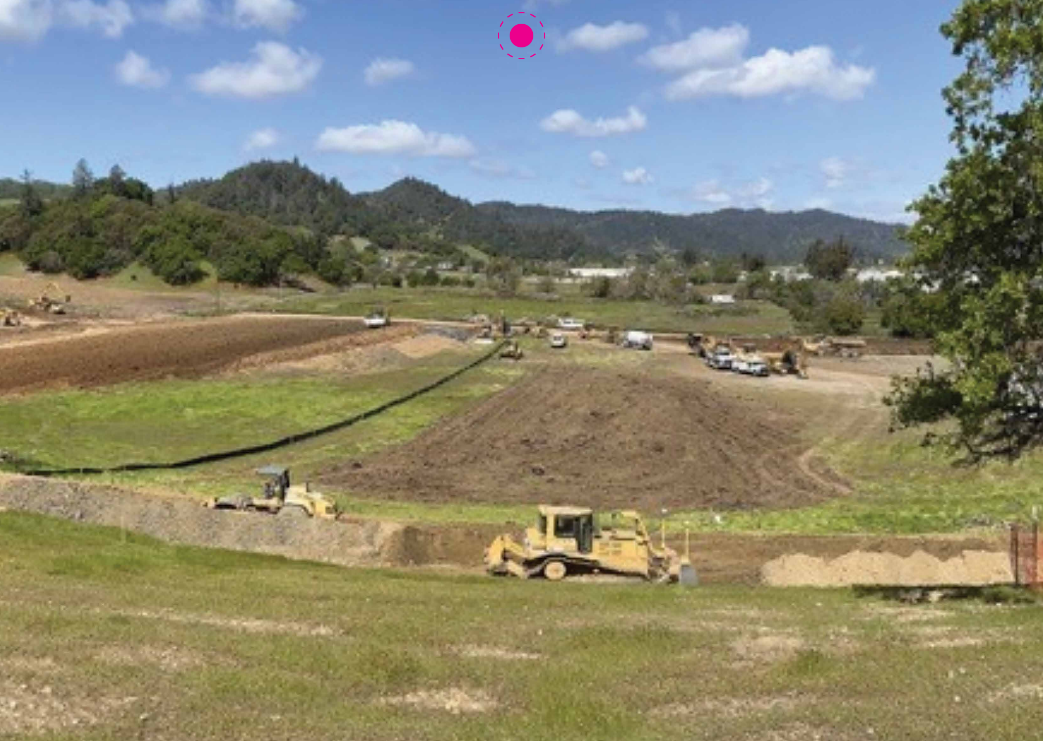
Dry Creek Rancheria Band of Pomo Indians Housing Development Project Site, Cloverdale, CA